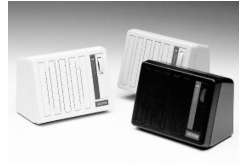
MODEL NO. V-762